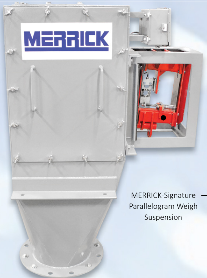
MERRICK-Signature Parallelogram Weigh Suspension